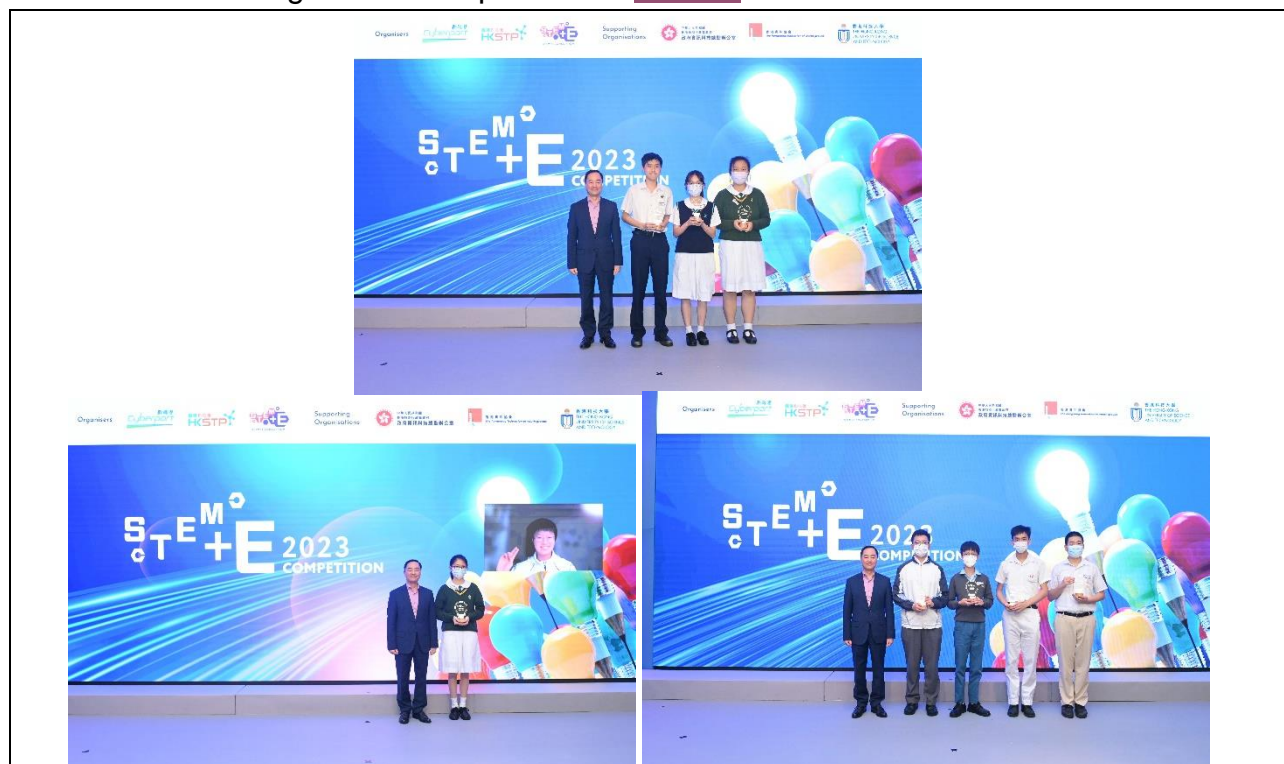
The champion teams: “高球隨意門” from the Entrepreneurship Track (above), “Restroom Navi - Gator” from the Regional Track (left), and “Cool Shield” from the Venture Track (right).

Please download high resolution photos via this link .